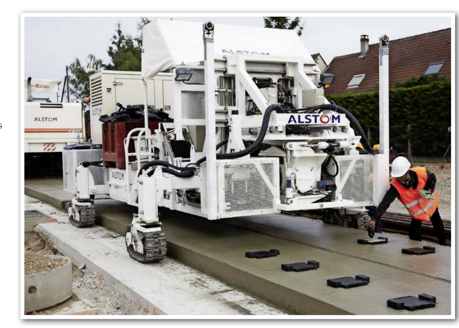
Nottingham Express Transit is where Alstom's Appitrack automated track laying system made its UK debut, in 2014, accelerating the laying of track by three to four times the normal rate. ALSTOM

Opened in 2004, Alstom was chosen to supply the rolling stock, and received an order for an initial batch of 40 Citadis trams which subsequently grew to a total of 66. These trams were originally 30 metres in length, but have since been extended to 40 metres by Alstom, as patronage continues to rise and Ireland's economy continues to recover from the financial crisis that hit the country particularly hard in 2008.