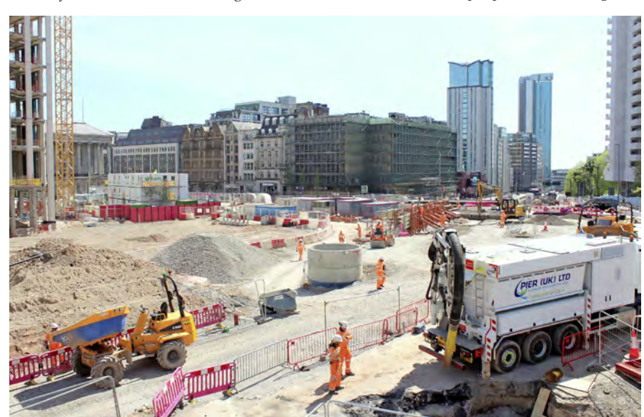
Construction continues apace for West Midlands Metro on a large site occupying Paradise Circus in Birmingham City Centre. The tram route will snake its way from outside Birmingham Town Hall in the background and into Centenary Square, to the right of the white lorry, and will include the UK's first stretch of catenary-free running. MIKE HADDON.