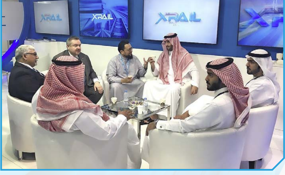
Left: XRAIL Group's expanding Middle Eastern project portfolio includes the design and installation of remote condition monitoring systems in Dubai in 2016. XRAIL. Above: At Middle East Rail 2018, the XRAIL team are pictured with HRH Prince Abdul Aziz bin Faisal Al Saud. XRAIL