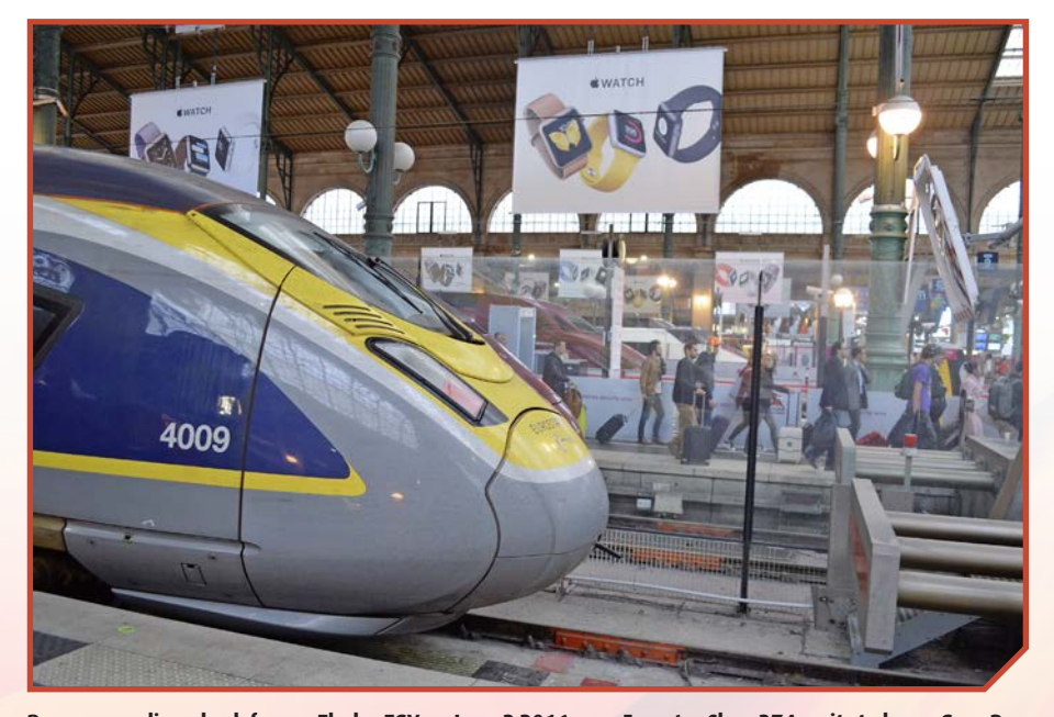
Passengers disembark from a Thalys TGV on June 3 2016, as a Eurostar Class 374 waits to leave Gare Du Nord. SNCF says some 750,000 passengers per day pass through the station, and that by the end of its rebuild in 2023, that will have increased to 800,000 per day - or 300 million per year.

"We're also making the station a beacon of eco-friendly development. It will have 7,000m<sup>2</sup> of green space and 3,200m<sup>2</sup> of solar panels."